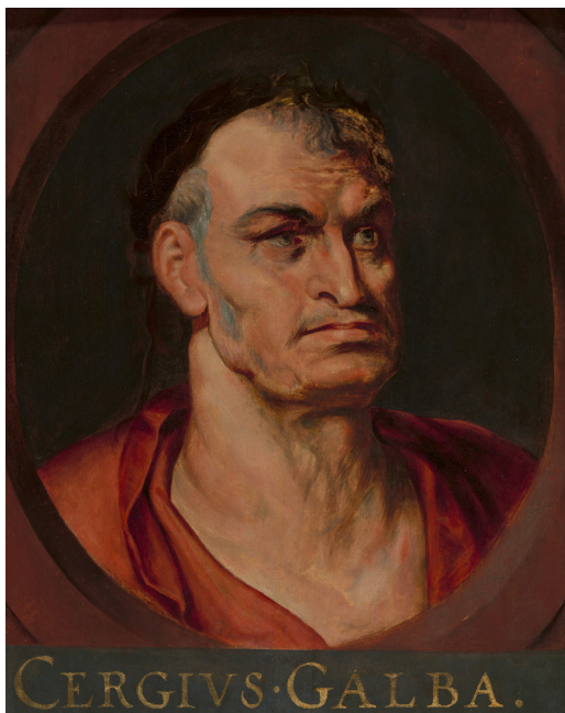
Fig. 2 Peter Paul Rubens (1577–1640), Emperor Servius Sulpicius Galba (3 BCE–69 CE). Oil on panel, 66.7 × 52.2 cm. The Phoebus Foundation