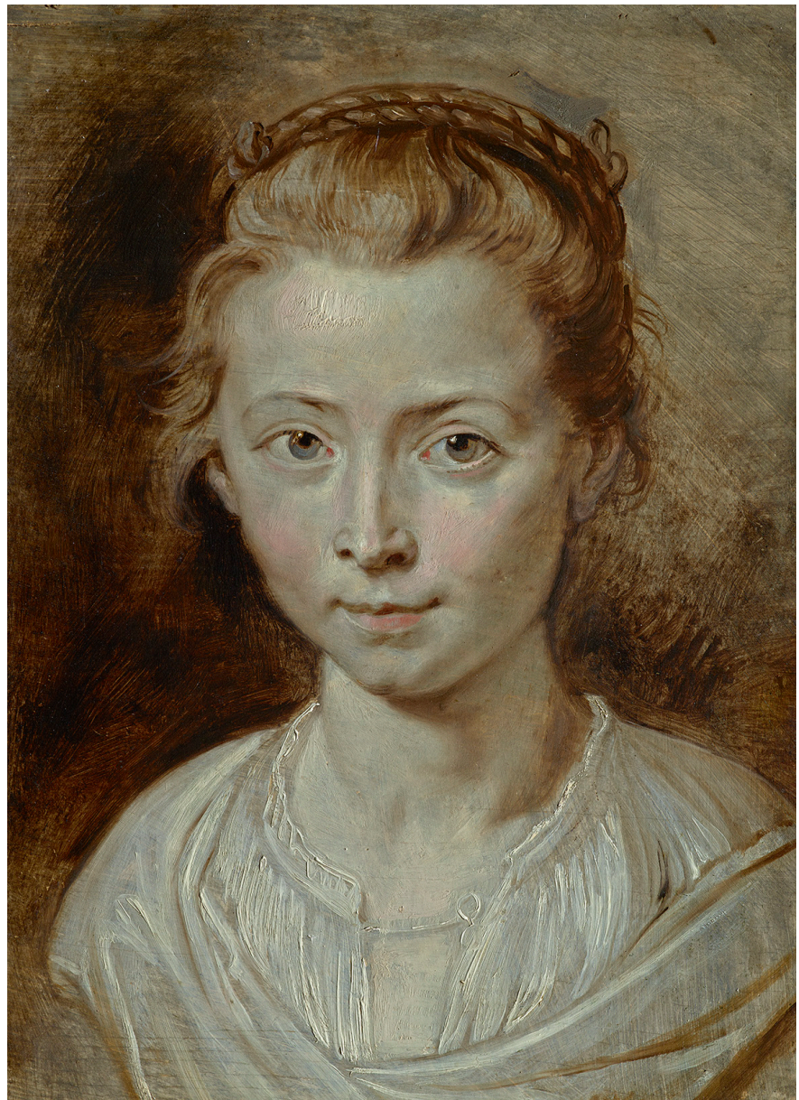
Fig. 1 Peter Paul Rubens (1577–1640), Clara Serena Rubens, the Artist's Daughter . Oil on panel, 35.6 × 26 cm. Private collection, London

fresh and powerful example of Van Dyck's ad vivum technique. Like other such studies by the artist, the composition was 'completed' by another hand, probably in the eighteenth or nineteenth century. This overpainting was removed during recent conservation treatment, revealing once again Van Dyck's brilliantly fresh and vibrant conception. His portraits are celebrated for their bravura brushwork and psychological astuteness – qualities which are exemplified in the present work. The head study was executed as a preparatory work for Van Dyck's important group portrait The Magistrates of Brussels Assembled around the Personification of Justice , painted for the Brussels Town Hall during Van Dyck's