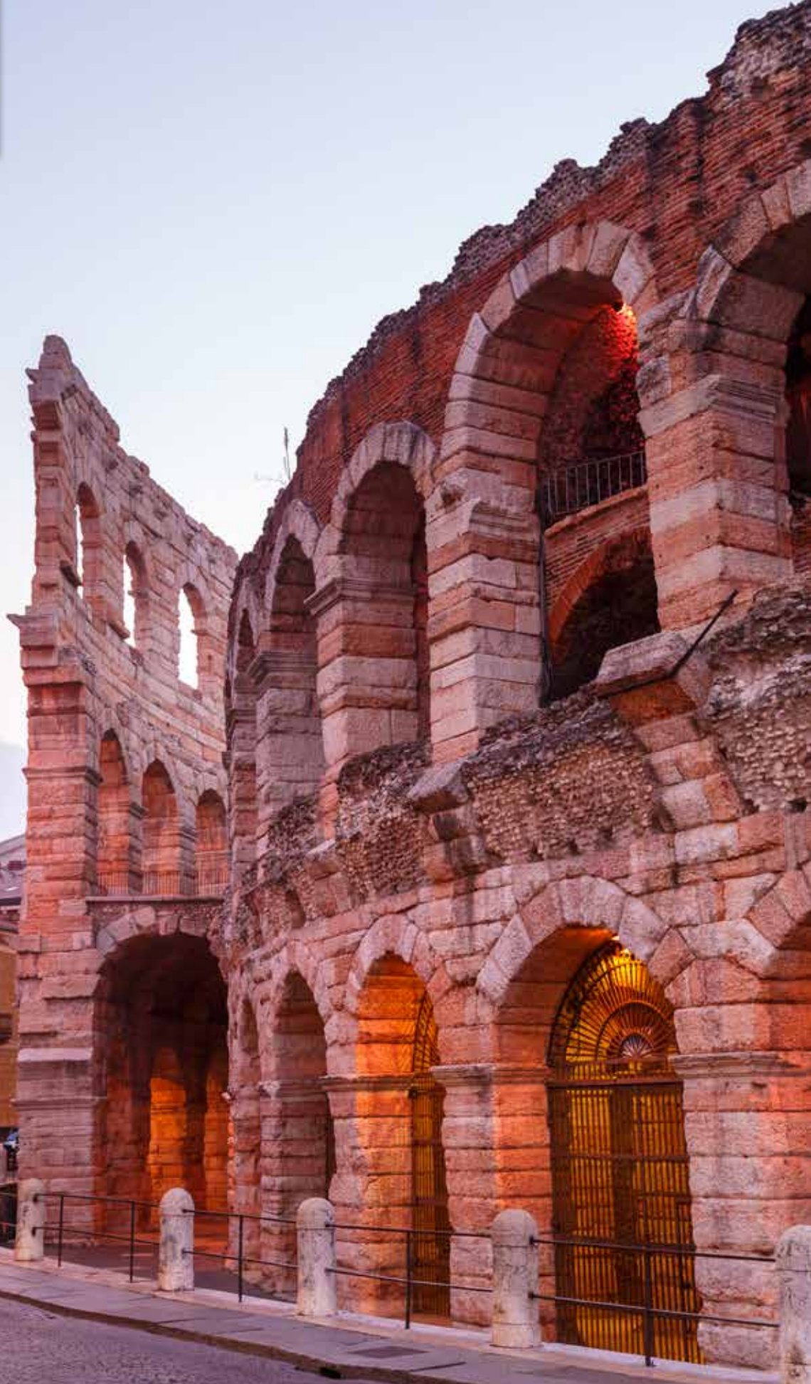
Colosseum Arena di Verona