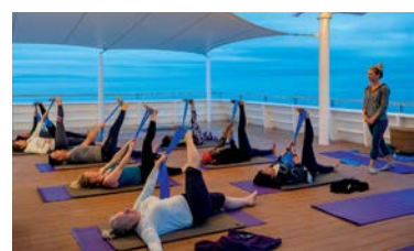
Category 4 cabin with single beds (which can be converted to a Queen) and a private step-out balcony; the casual dining room with its expansive windows; morning stretches on the sun deck.