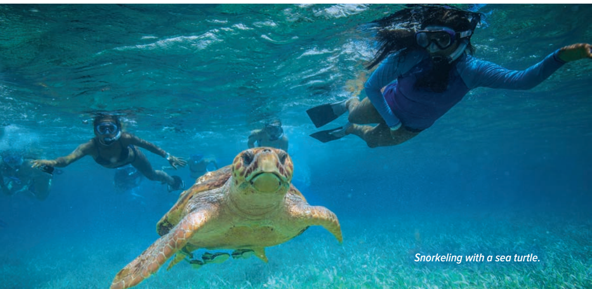
Snorkeling with a sea turtle.

6 DAYS/5 NIGHTS—NATIONAL GEOGRAPHIC QUEST