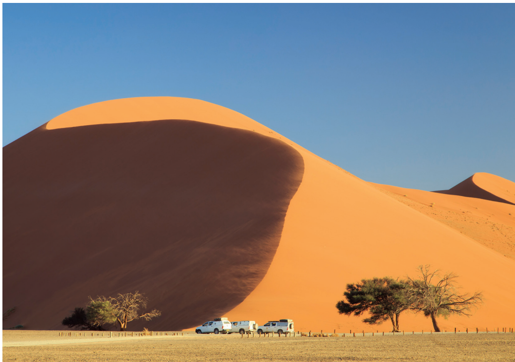
We explore the crested dunes at Sossusvlei, among the world's highest at 1,300 feet.

in all Africa, including the world's largest elephant population (some 120,000), as well as zebra, lion, hippo, giraffe, impala, wildebeest, buffalo, and more. We're sure to see some of them on today's full-day excursion to Chobe, where we take a morning game drive and an afternoon game cruise. B,L,D