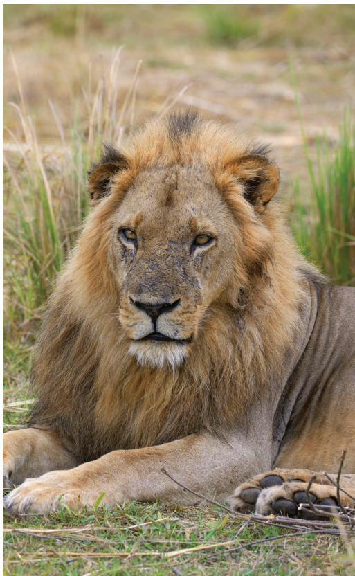
Taking a break ...

Day 18: Arrive U.S. We arrive in the U.S. today and connect with our flights home.